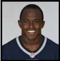
Matthew Slater 7th Pro Bowl

Rob Gronkowski is headed to his fifth career Pro Bowl. The eight-year veteran tight end also earned a Pro Bowl invitation following the 2011, 12, 14 and 15 seasons. This season, Gronkowski joined Tony Gonzalez and Jason Witten as the only tight ends in NFL history with four 1,000-yard seasons. He also moved into the top 10 all-time for receiving yards by a tight end.