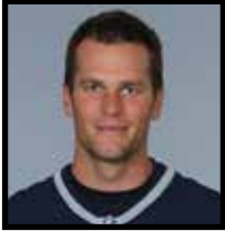
Tom Brady 13th Pro Bowl

Tom Brady has been named to the Pro Bowl for a franchise record 13th time in his 18-year career and this is his ninth consecutive selection to the all-star game. Brady has passed G John Hannah (1978-85) for most consecutive Pro Bowl selections in franchise history. With his 13th Pro Bowl selection, Brady joins Tony Gonzalez (14), Peyton Manning (14), Bruce Matthews (14), Merlin Olsen (14), Ray Lewis (13), Jerry Rice (13) and Reggie White (13) as the only NFL players with at least 13 Pro Bowl berths. Brady also won AFC Player of the Month for November and AFC Player of the Week for his efforts in Weeks 2, 3 and 10.