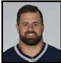
James Develin 1st Pro Bowl

Tom Brady has been named to the Pro Bowl for a franchise record 13th time in his 18-year career and this is his ninth consecutive selection to the all-star game. Brady has passed G John Hannah (1978-85) for most consecutive Pro Bowl selections in franchise history. With his 13th Pro Bowl selection, Brady joins Tony Gonzalez (14), Peyton Manning (14), Bruce Matthews (14), Merlin Olsen (14), Ray Lewis (13), Jerry Rice (13) and Reggie White (13) as the only NFL players with at least 13 Pro Bowl berths. Brady also won AFC Player of the Month for November and AFC Player of the Week for his efforts in Weeks 2, 3 and 10.