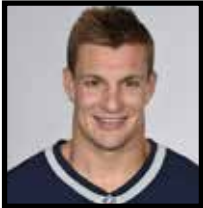
Rob Gronkowski 5th Pro Bowl