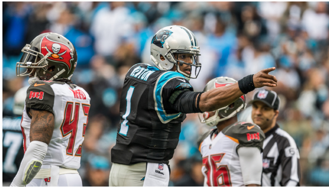
Cam Newton now ranks third all-time in career rushing yards (4,261) by an NFL quarterback.

Newton also surpassed 3,000 passing yards this season (3,122) and now has at least 3,000 passing yards in each of his first seven seasons. Only Peyton Manning and Andy Dalton have achieved the same feat in NFL history.