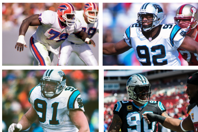
Three of the top four sack artists in NFL history played for the Panthers at one point in their career.