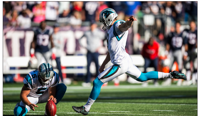
Kicker Graham Gano's 48-yard field goal as time expired at New England (10/1/17), gave the Panthers a 33-30 victory.