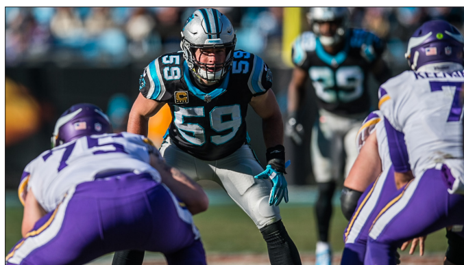
Linebacker Luke Kuechly has been among the NFL's tackle leaders since entering the NFL. No one has more than his 808 stops since the start of 2012.