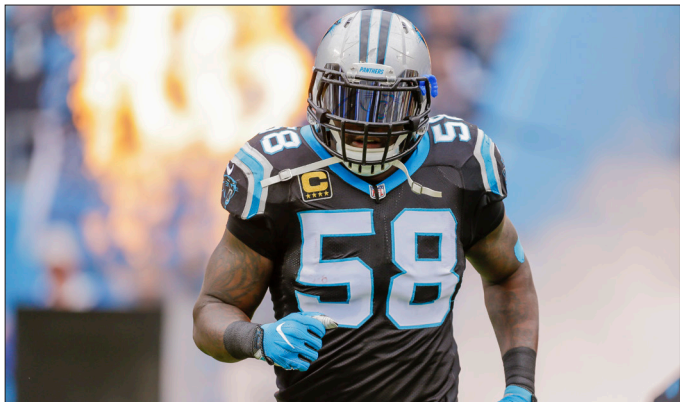
Linebacker Thomas Davis has averaged 130 tackles per season in the last five years and is the Panthers all-time leader with 1,163 tackles.

Davis has averaged 130 tackles per season over the last five seasons (653 from 2012-16), including a career-high 151 in 2013.