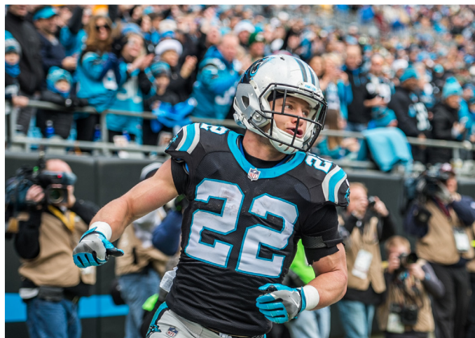
Christian McCaffrey ranks fourth among NFL rookies with 1,252 all-purpose yards.