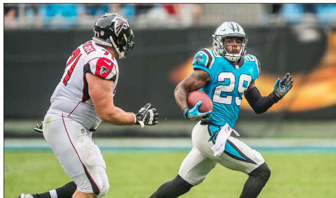
Mike Adams has made 21 total takeaways since 2014, ranking third in the NFL over that span.

Adams also has seven fumble recoveries over the last four seasons, ranking third in the NFL with 21 total takeaways.