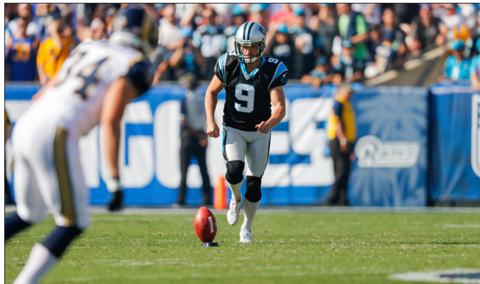
Kicker Graham Gano has been one of the leading kickoff men in the NFL over the past five seasons, tied for first in the NFL in touchback percentage.

Gano currently holds the best single-season touchback percentage in franchise history. He is three touchbacks away from the franchise's total touchback record which he set in 2015 (69).