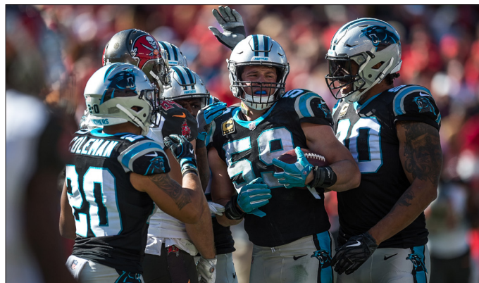
Linebacker Luke Kuechly has recorded two interceptions in the last four games. He has the most INTs by any linebacker since 2012.