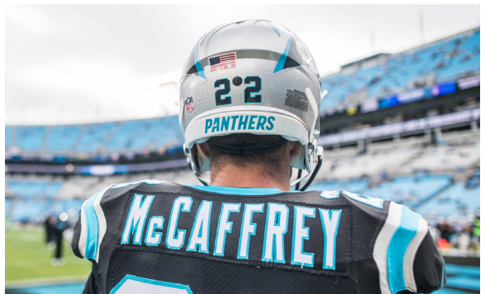
Christian McCaffrey owns the franchise record for most receptions by a rookie.

McCaffrey also topped 400 yards rushing for the season, giving Carolina three different players with at least 400 rushing yards for the first time since 2011. No other NFL team has three players with at least 400 rushing yards.