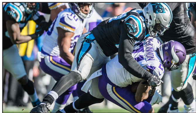
The Panthers have not allowed a 100-yard rusher in a game this season.