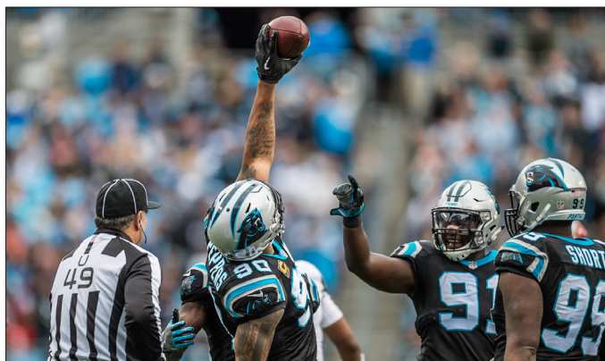
Julius Peppers recovered two fumbles against Tampa Bay. He has 20 career fumble recoveries which lead all active players.

This season, Carolina is 9-1 when scoring any points off turnovers and 9-1 when winning or tied in turnover differential.