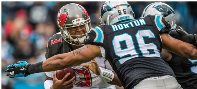
Carolina recorded six sacks for the third time this season, a mark that leads the NFL.

Julius Peppers had a sack and recovered two fumbles and now has 20 career fumble recoveries, the most of any active player.