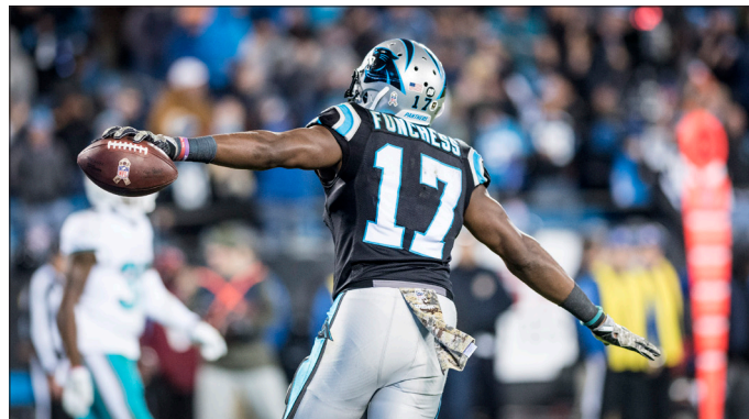
Wide receiver Devin Funchess scored two touchdowns for the second time in his career against Miami (11/13/17).

Funchess' career best game is a 120-yard effort against Tampa Bay in his rookie season (1/3/16).