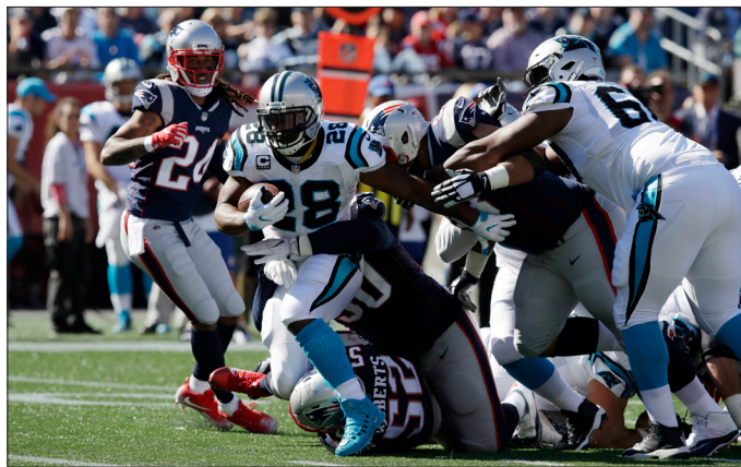
Running back Jonathan Stewart became the Panthers all-time leading rusher at New England (10/1/17).