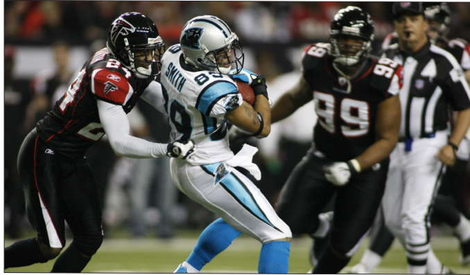
Wide receiver Steve Smith caught eight passes for 168 yards with a long of 41 at Atlanta in 2008. It marked the eighth-highest receiving game of his career.

Rushing yards 165, DeShaun Foster at Atlanta (1/1/06) Receiving yards 168, Steve Smith at Atlanta (11/23/08) Receptions 10, 2x, Muhsin Muhammad at Atlanta (12/18/04) Passing yards 340, Jake Delhomme at Atlanta (12/18/04)