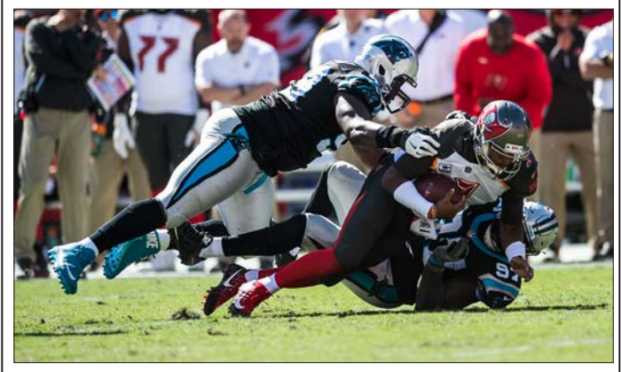
The Panthers tallied three sacks at Tampa Bay and currently rank second in the NFL in sacks.