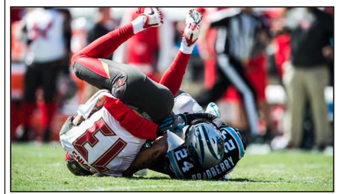
The Panthers have not allowed an opposing running back or receiver to gain over 100 yards in a single game this season.