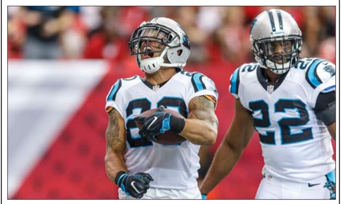
Safety Kurt Coleman celebrates his interception return for a touchdown at Atlanta (10/2/16).