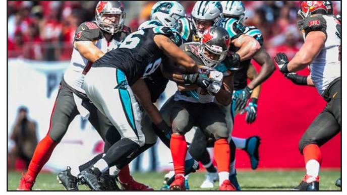
The Panthers did not allow an offensive touchdown at Tampa Bay, tying a franchiserecord for the fourth game in a season without an offensive touchdown.