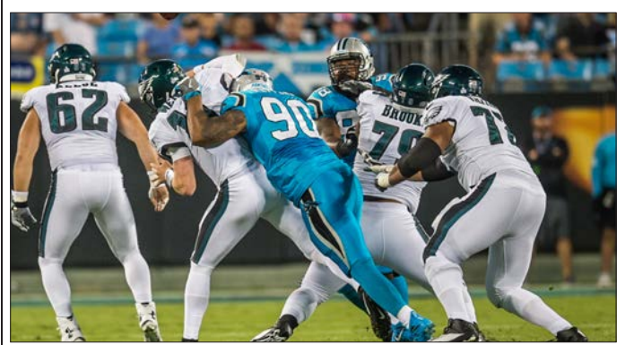
Defensive end Julius Peppers forces a fumble by quarterback Carson Wentz vs. Philadelphia (10/12/17).