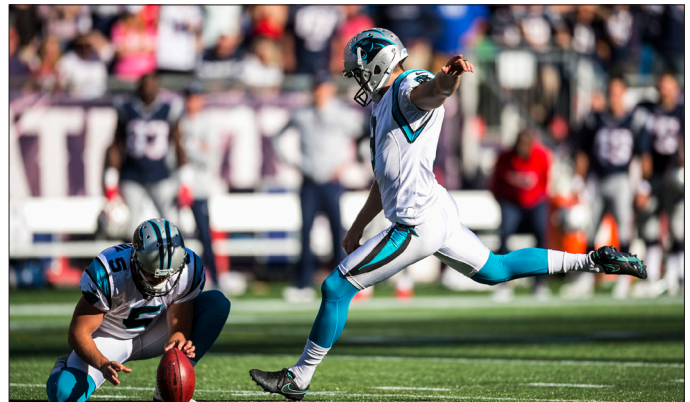
Kicker Graham Gano's 48-yard field goal as time expired at New England (10/1/17), gave the Panthers a 33-30 victory.