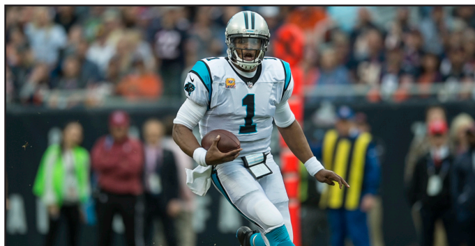
Cam Newton leads the NFL with 14 rushing first downs on third down this season.

Carolina's defense ranks ninth in the NFL on third down, allowing a conversion percentage of 35.5.