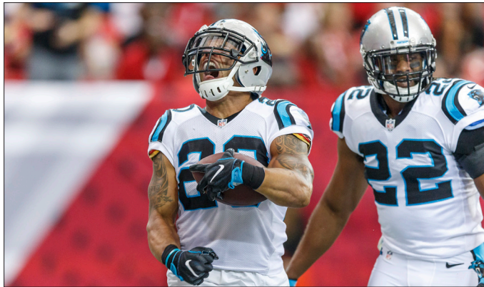
Safety Kurt Coleman celebrates his interception return for a touchdown at Atlanta (10/2/16).