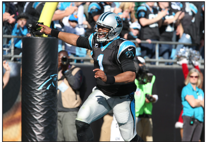
The Panthers led the NFL in scoring in 2015 with 31.3 points per game.