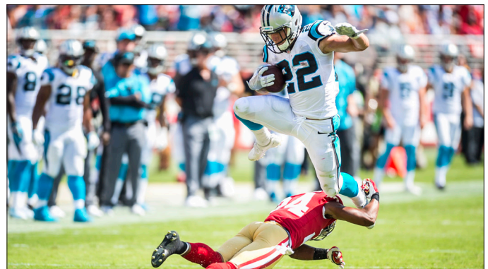
First-round draft choice Christian McCaffrey joins a historically strong running attack in Carolina.