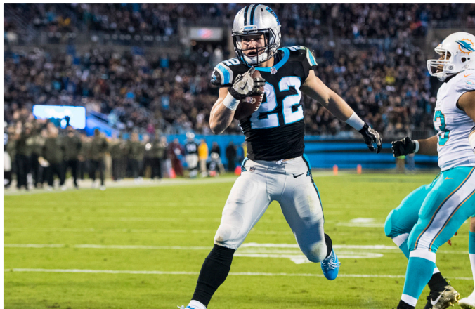
Christian McCaffrey scored his second rushing touchdown in as many games against Miami on Monday Night Football.