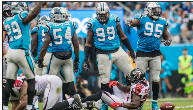
The Panthers have not allowed a 100-yard rusher in a game this season.