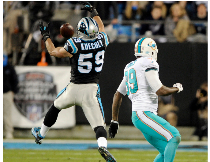
Luke Kuechly's interception set up a Panthers' touchdown with less than a minute to go in the second quarter.

Carolina has now made four interceptions in the last three games after going a franchise-long six games without a pick. Carolina's four interceptions are tied for the league lead over that stretch.