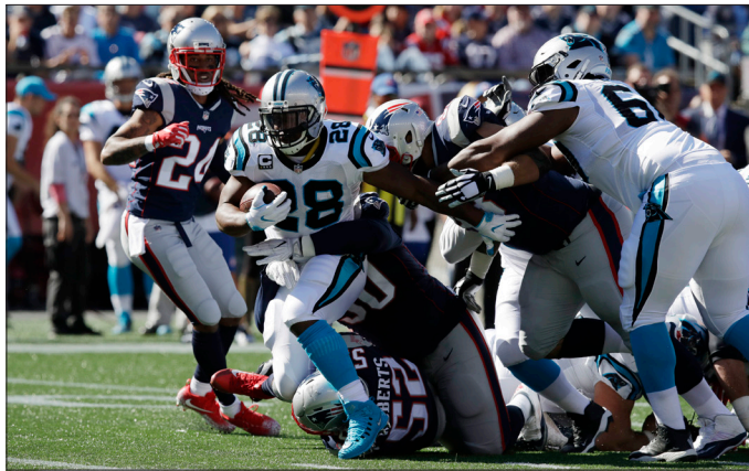
Running back Jonathan Stewart became the Panthers all-time leading rusher at New England (10/1/17).