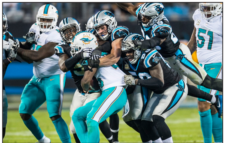
Carolina's defense is on pace to set new franchise records for total yards and rushing yards allowed.