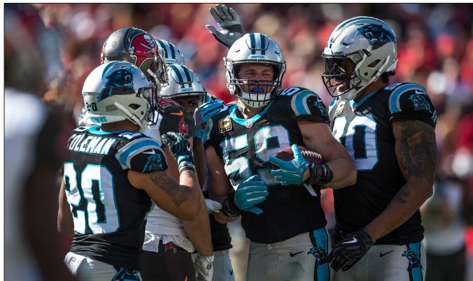
Linebacker Luke Kuechly has recorded two interceptions in the last three games. He has the most INTs by any linebacker since 2012.