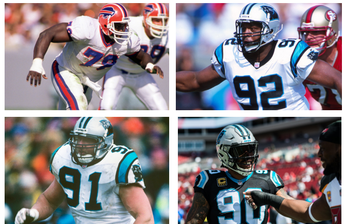
Three of the top four sack artists in NFL history played for the Panthers at one point in their career.