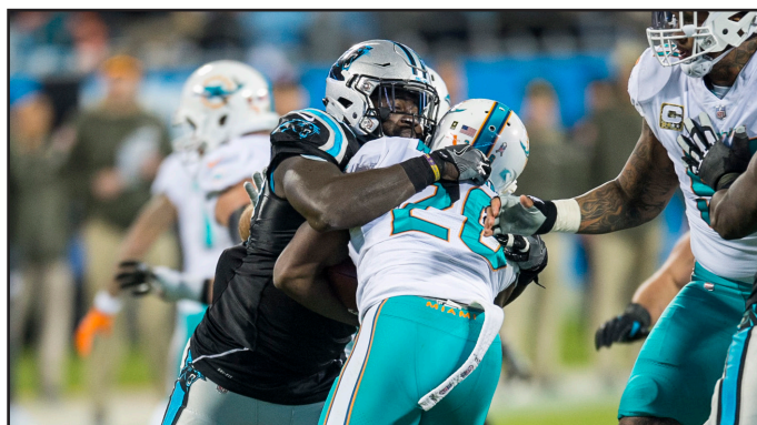
Carolina has only allowed nine rushing first downs on third down this year, tied for sixth in the NFL.

On third down, the defense has tallied 11 sacks and 26 quarterback hurries, good for fourth in the NFL. Carolina has only allowed nine rushing first downs, tied for sixth-best in the NFL.