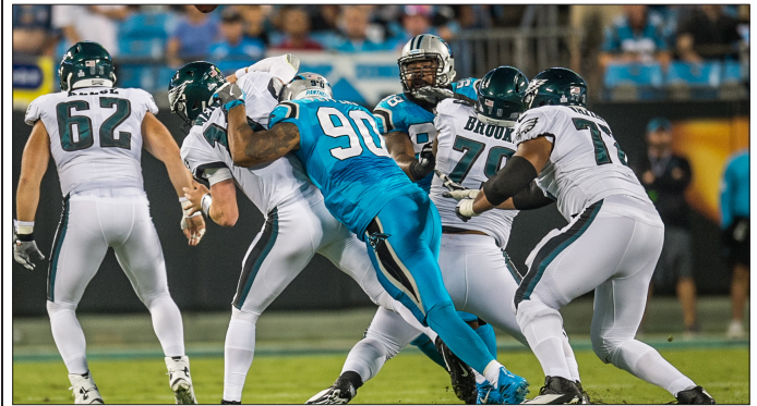
Defensive end Julius Peppers forces a fumble by quarterback Carson Wentz vs. Philadelphia (10/12/17).