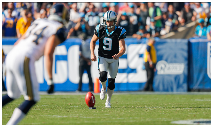
Kicker Graham Gano has been the leading kickoff man in the NFL over the past five seasons, second in the NFL in touchback percentage.

In 2013, 63 of Gano's 79 kickoffs resulted in touchbacks. His 79.7 touchback percentage was the top mark in the NFL and the highest percentage in a season since Brad Daluiso in 1992 (81.3 percent).