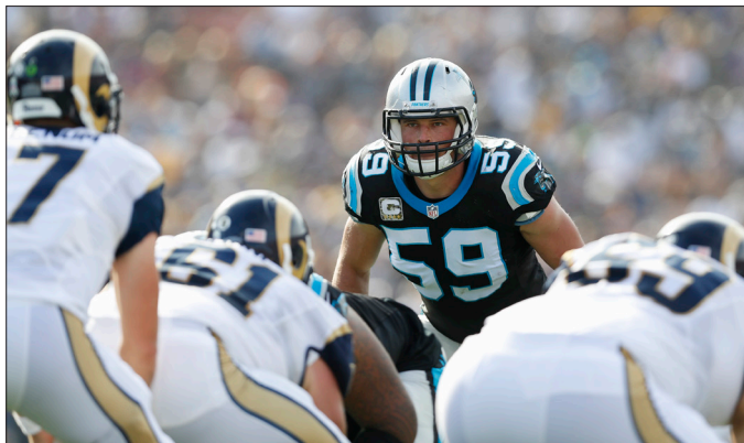
Linebacker Luke Kuechly has been among the NFL's tackle leaders since entering the NFL. No one has more than his 764 stops since the start of 2012.