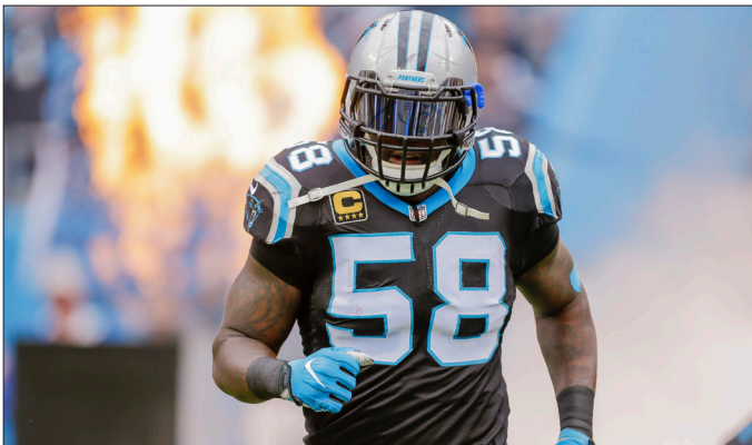
Linebacker Thomas Davis has averaged 130 tackles per season in the last five years and is the Panthers all-time leader with 1,145 tackles.

Davis has averaged 130 tackles per season over the last five seasons (653 from 2012-16), including a career-high 151 in 2013.