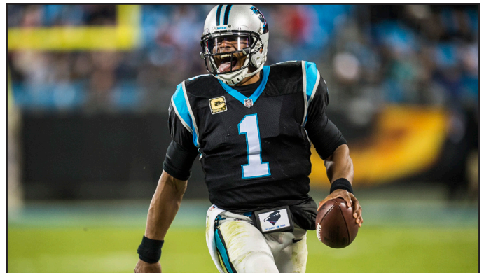
Cam Newton ran for 95 yards and threw for 254 yards with four passing touchdowns.

Newton's award was the ninth offensive weekly award of his career, the most in Panthers history.