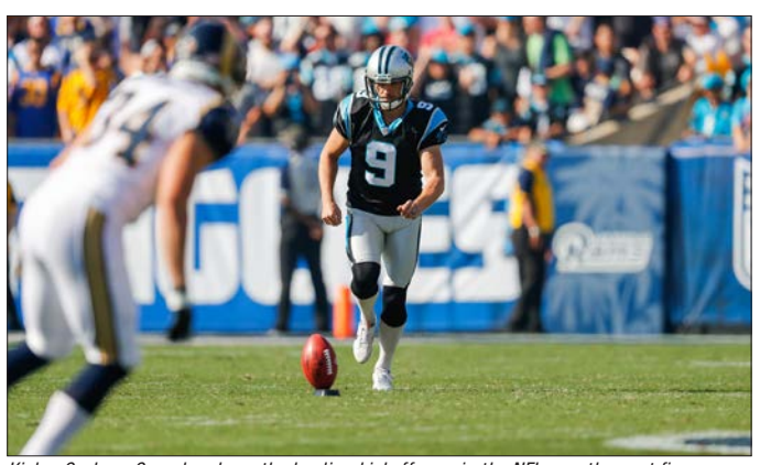
Kicker Graham Gano has been the leading kickoff man in the NFL over the past five seasons, second in the NFL in touchback percentage.

In 2013, 63 of Gano's 79 kickoffs resulted in touchbacks. His 79.7 touchback percentage was the top mark in the NFL and the highest percentage in a season since Brad Daluiso in 1992 (81.3 percent).