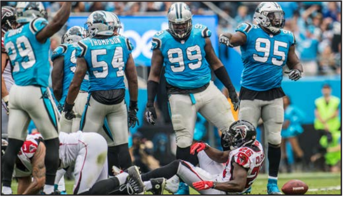
The Panthers have not allowed a 100-yard rusher in a game this season.