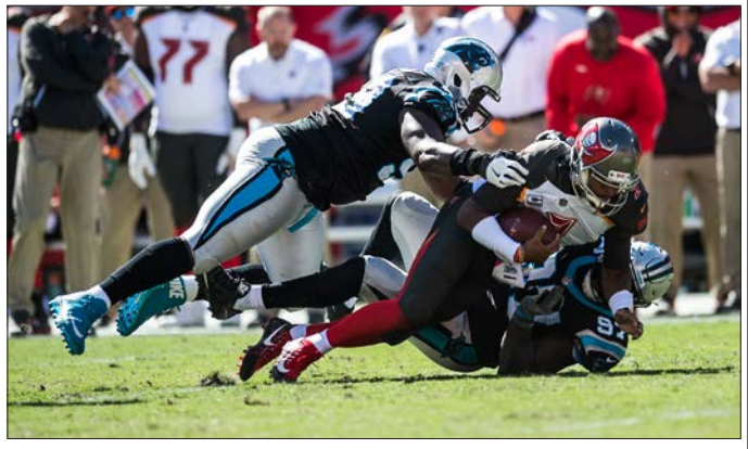
The Panthers tallied three sacks at Tampa Bay and currently rank second in the NFL in sacks.