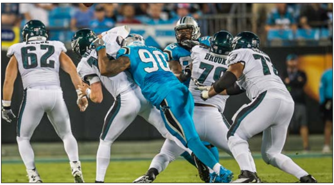
Defensive end Julius Peppers forces a fumble by quarterback Carson Wentz vs. Philadelphia (10/12/17).