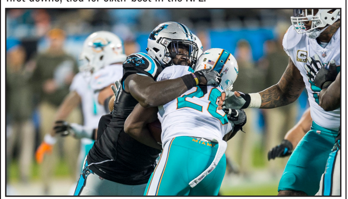
Carolina has only allowed 10 rushing first downs on third down this year, tied for sixth in the NFL.

On third down, the defense has tallied 13 sacks and 28 quarterback hurries, good for sixth in the NFL. Carolina has only allowed 10 rushing first downs, tied for sixth-best in the NFL.