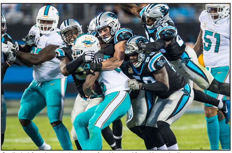
Carolina's defense is on pace to set a new franchise record for rushing yards allowed.