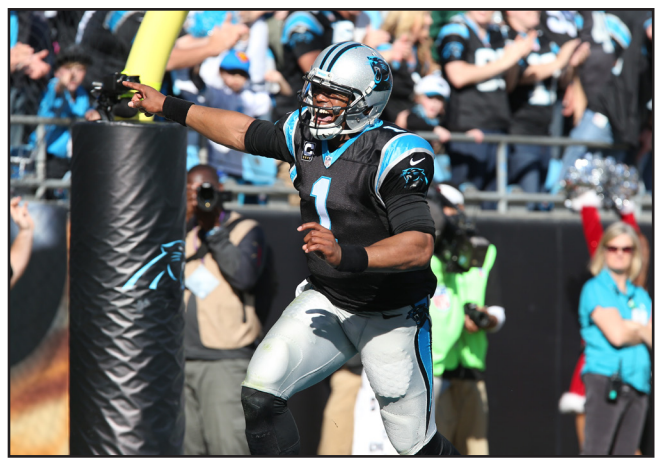
The Panthers led the NFL in scoring in 2015 with 31.3 points per game.