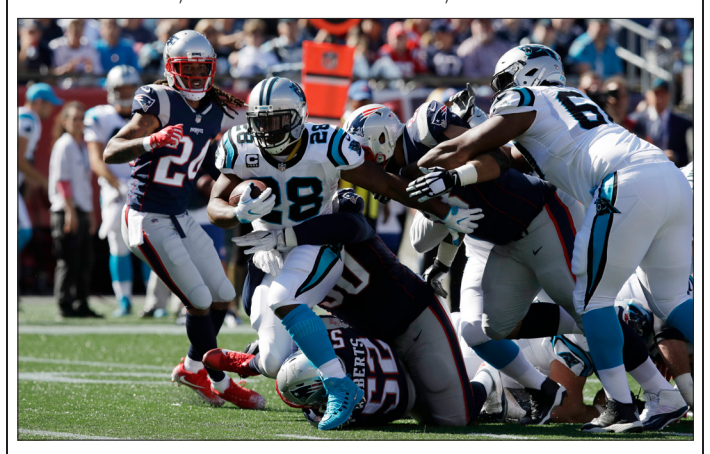
Running back Jonathan Stewart became the Panthers all-time leading rusher at New England (10/1/17).