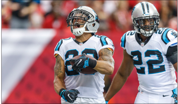
Safety Kurt Coleman celebrates his interception return for a touchdown at Atlanta (10/2/16).