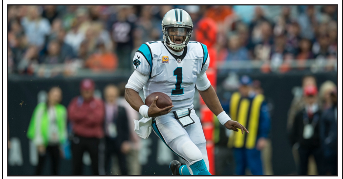
Cam Newton leads the NFL with 15 rushing first downs on third down this season.

Carolina's defense ranks ninth in the NFL on third down, allowing a conversion percentage of 35.5.