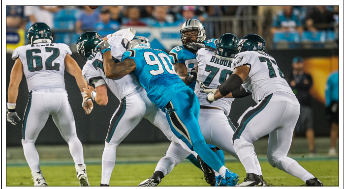
Defensive end Julius Peppers forces a fumble by quarterback Carson Wentz vs. Philadelphia (10/12/17).