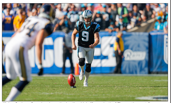
Kicker Graham Gano has been the leading kickoff man in the NFL over the past five seasons, second in the NFL in touchback percentage.

In 2013, 63 of Gano's 79 kickoffs resulted in touchbacks. His 79.7 touchback percentage was the top mark in the NFL and the highest percentage in a season since Brad Daluiso in 1992 (81.3 percent).