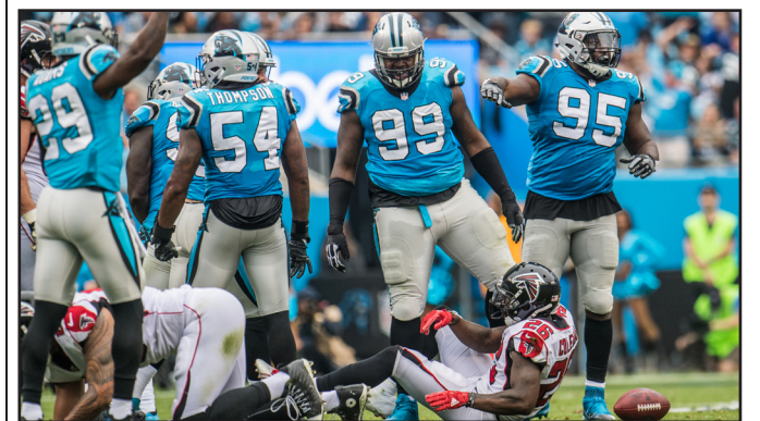
The Panthers have not allowed a 100-yard rusher in a game this season.