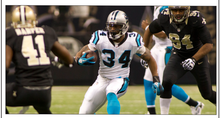
DeAngelo Williams set a franchise record with 210 rushing yards at New Orleans in 2012.