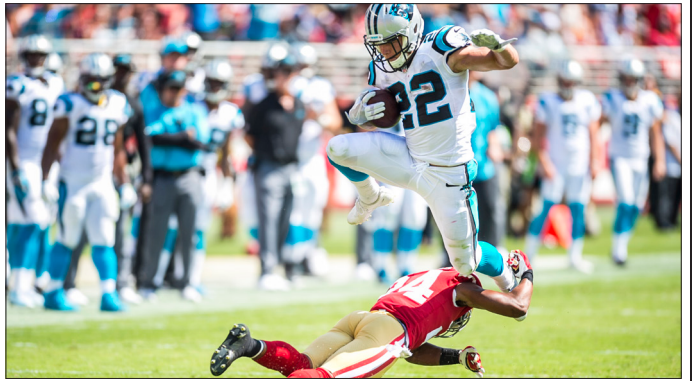
First-round draft choice Christian McCaffrey joins a historically strong running attack in