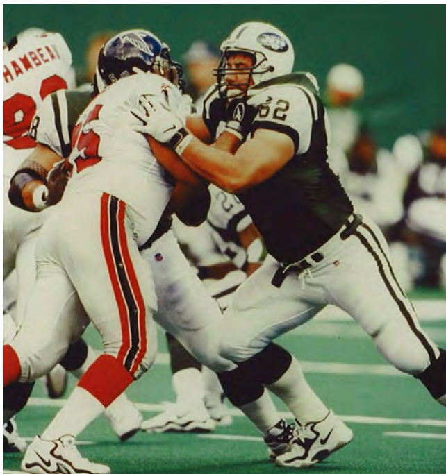
NEW YORK JETS vs. ATLANTA FALCONS | 10|25|98