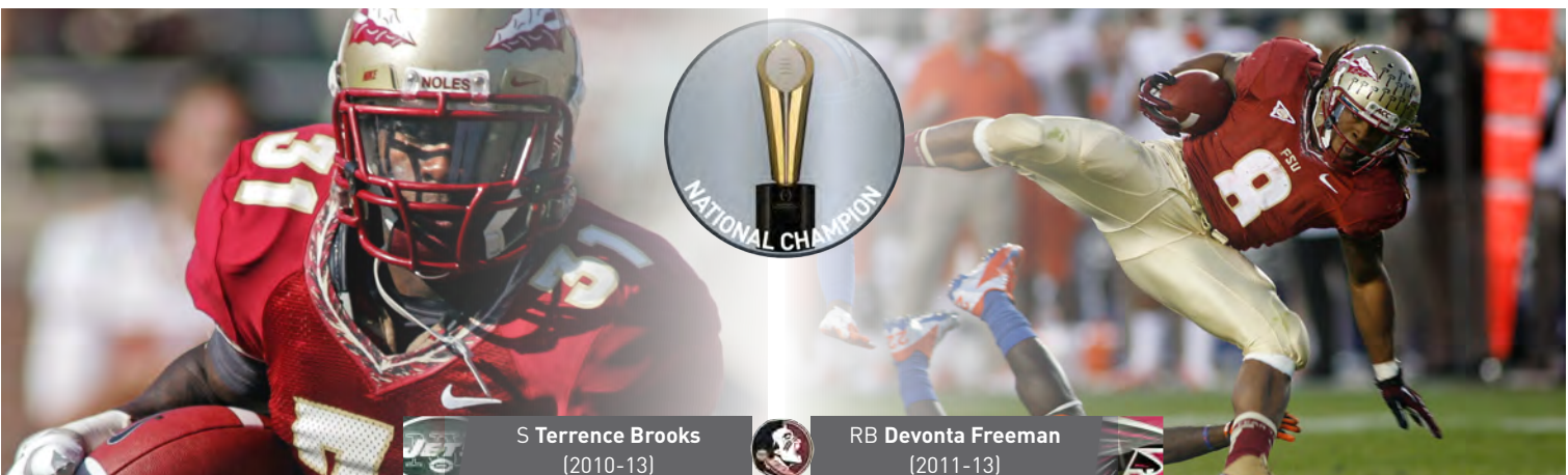
S Terrence Brooks (2010-13)