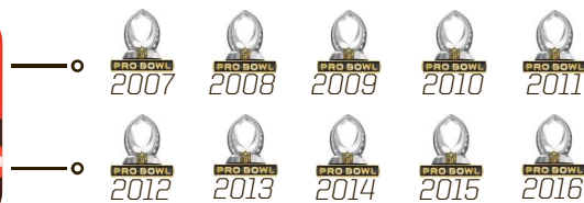
Cleveland Browns vs. Minnesota Vikings Regular Season Week 8, Game 8