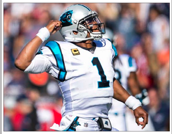
Quarterback Cam Newton totaled four touchdowns at New England (10/1/17), directed his 13th career game-winning drive and produced the seventh-best passer rating of his

Newton tallied the 15th 300-yard passing game of his career as he completed 22-of-29 passes for 316 yards and a passer rating of 130.8. The 75.9 completion percentage was the sixth-best of his career.