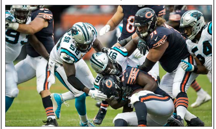
The Panthers only allowed 153 net yards to the Bears, the second-fewest in a game in the NFL this year.