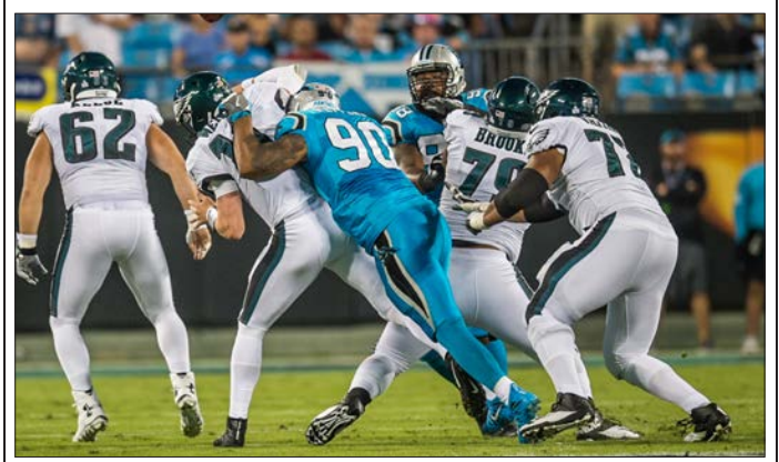
Defensive end Julius Peppers forces a fumble by quarterback Carson Wentz vs. Philadelphia (10/12/17).