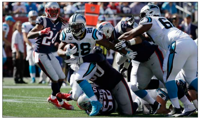
Running back Jonathan Stewart became the Panthers all-time leading rusher at New England (10/1/17).