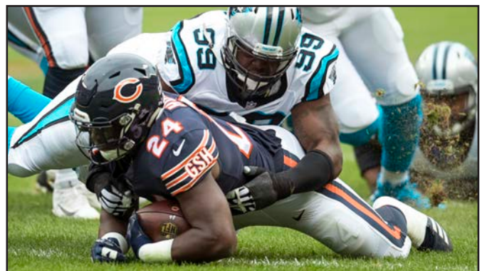
The Panthers have not allowed an opposing running back to rush for over 100 yards in 11 games dating back to 12/4/16.