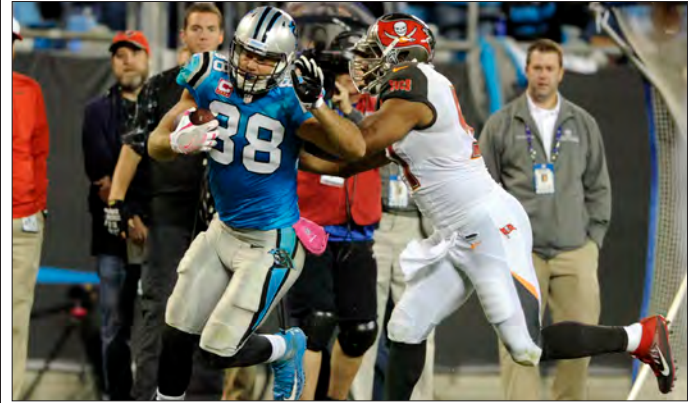
Tight end Greg Olsen's 181 yards vs. Tampa Bay (10/10/16) helped him pass Kellen Winslow (1979-87) for eighth all-time in receiving yards among NFL tight ends.

Olsen is tied for 11th among NFL tight ends with 52 career touchdown receptions. Olsen needs one more touchdown catch to tie Dallas Clark (53 from 2003-13) for 10th all-time.