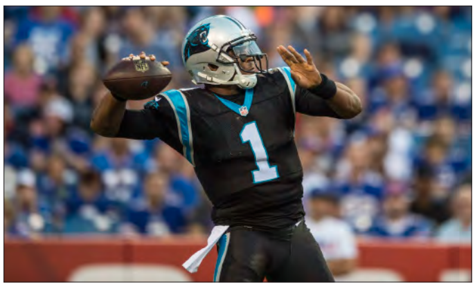
Quarterback Cam Newton ranks first in nearly all of the Panthers all-time passing statistics