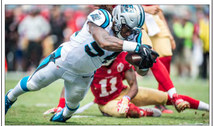
Linebacker Shaq Thompson dives into the end zone vs. San Francisco (9/18/16) for six of the Panthers 95 takeaway points in 2016.