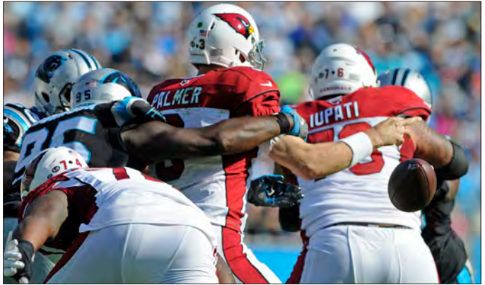
Defensive end Charles Johnson forces a fumble by quarterback Carson Palmer vs. Arizona (10/30/16).