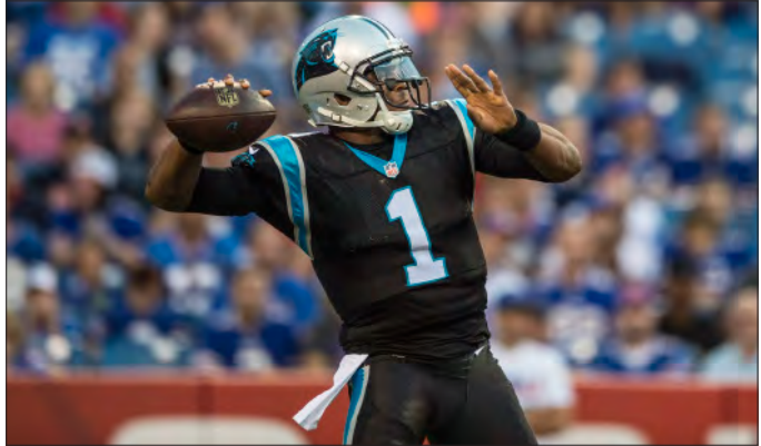
Quarterback Cam Newton ranks first in nearly all of the Panthers all-time passing statistics.