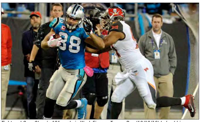
Tight end Greg Olsen's 181 yards in Week Five vs. Tampa Bay (10/10/16) helped him pass Kellen Winslow (1979-87) for eight all-time in receiving yards among NFL tight ends.

Olsen is tied for 11th among NFL tight ends with 52 career touchdown receptions. Olsen needs one more touchdown catch to enter the top 10 all-time among tight ends.