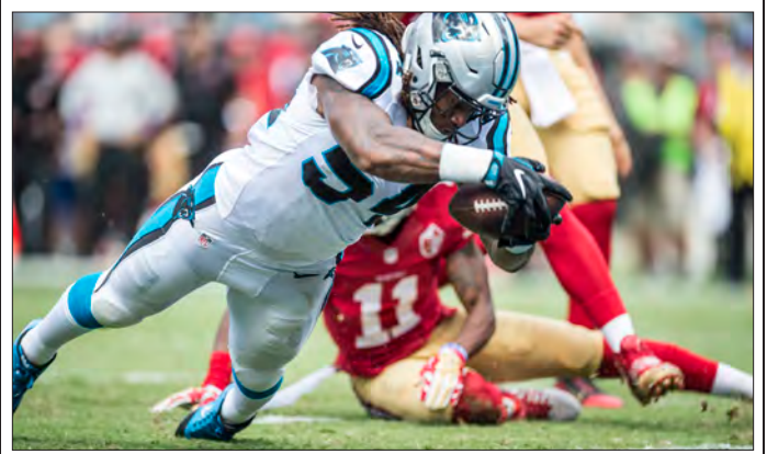
Linebacker Shaq Thompson dives into the end zone at San Francisco (9/18/16) for six of the Panthers 95 takeaway points in 2016.