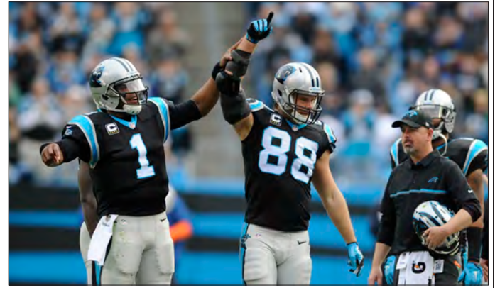
Quarterback Cam Newton celebrates with tight end Greg Olsen after Olsen passed 1,000 receiving yards for the season in Week Sixteen vs. Atlanta (12/24/16).