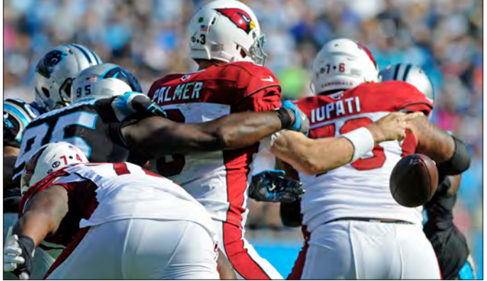
Defensive end Charles Johnson forces a fumble by quarterback Carson Palmer in Week Eight vs. Arizona (11/6/16).