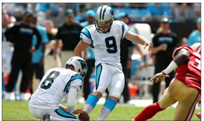
Kicker Graham Gano set a career high with 16 points in Week Two vs. San Francisco (9/18/16).

In 2013, 63 of Gano's 79 kickoffs resulted in touchbacks. His 79.7 touchback percentage was the top mark in the NFL that season and is the highest percentage in a season since Brad Daluiso in 1992 (81.3 percent).