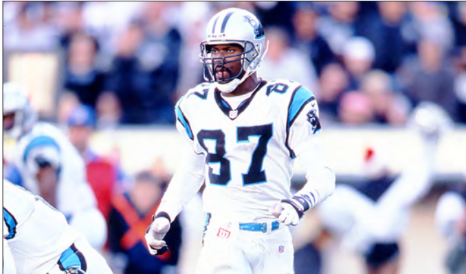
Wide receiver Muhsin Muhammad

Rushing yards: 147, Fred Lane (11/2/97 at Car.) Receiving yards: 114, Muhsin Muhammad (12/24/00 at Oak.) Receptions: 10, Muhsin Muhammad (12/24/00 at Oak.) Passing yards: 299, Jake Delhomme (11/7/04 at Car.)