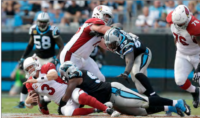
Defensive tackle Kawann Short takes down Arizona quarterback Carson Palmer in Week Ten (10/30/16).