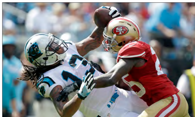
Kelvin Benjamin reaches behind 49ers defensive back Jimmie Ward for a catch vs. San Francisco (9/18/16).

It was the third two-touchdown game (including the playoffs) of Benjamin's career. He previously scored multiple touchdowns at Philadelphia (11/10/14) and at Seattle (1/10/15).