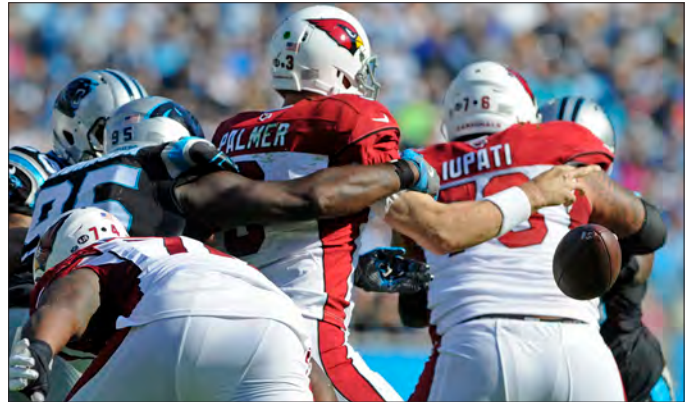
Defensive end Charles Johnson forces a fumble by quarterback Carson Palmer in Week Eight vs. Arizona (11/6/16).