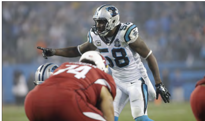
Linebacker Thomas Davis has averaged 130 tackles per season in the last four years and is the Panthers all-time leader with 1,039 tackles.

Davis has averaged 130 tackles per season over the last four seasons (521 from 2012-15), including a career-high 151 in 2013.