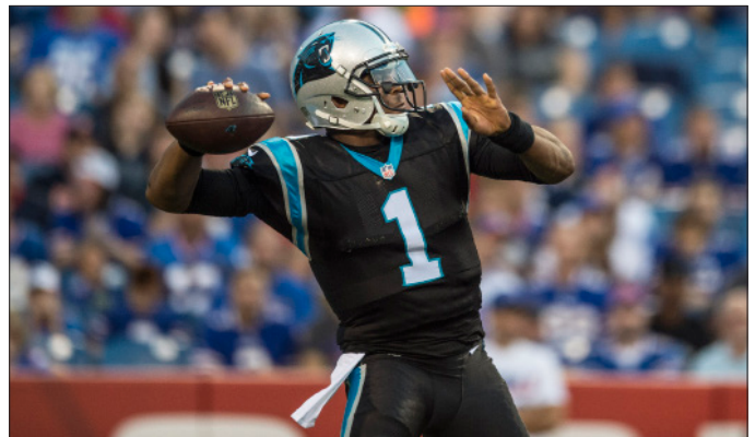
Quarterback Cam Newton ranks first or second in many of the Panthers all-time passing statistics.