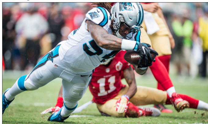
Linebacker Shaq Thompson dives into the end zone at San Francisco (9/18/16) for the six of the Panthers 30 takeaway points in 2016.