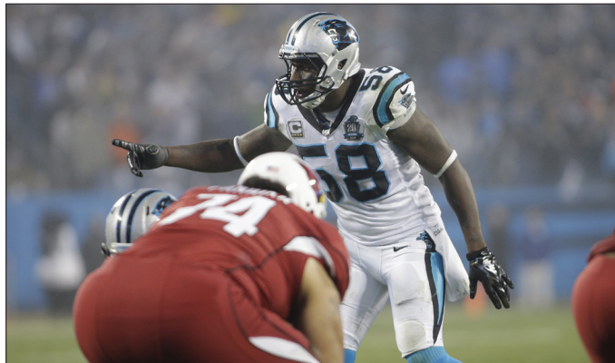
Linebacker Thomas Davis has averaged 130 tackles per season in the last four years and is the Panthers all-time leader with 984 tackles.

Davis has averaged 130 tackles per season over the last four seasons (521 from 2012-15), including a career-high 151 in 2013.