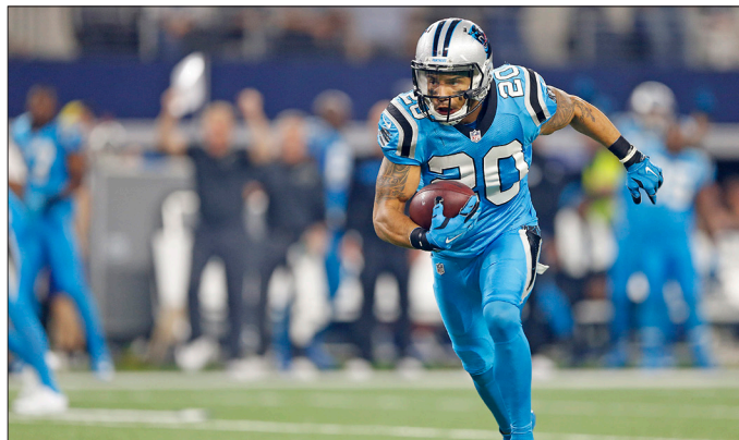
Safety Kurt Coleman interception touchdown at Dallas (11/26/15) was one of four by the Panthers in 2015, tied with Denver for the NFL lead.