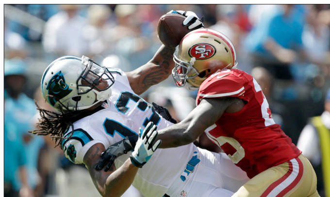
Kelvin Benjamin reaches behind the 49ers Jimmie Ward for a catch vs. San Francisco (9/18/16).

It was the third two-touchdown game (including the playoffs) of Benjamin's career. He previously scored multiple touchdowns at Philadelphia (11/10/14) and at Seattle (1/10/15).