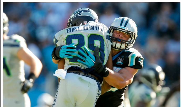
Linebacker Luke Kuechly has been among the NFL's tackle leaders since entering the NFL. No one has more than his 637 stops since the start of 2012.