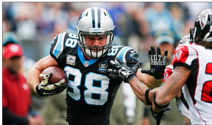
Greg Olsen is the first 1,000-yard tight end in Panthers' history, accomplishing the feat in consecutive seasons (2014 and 2015).