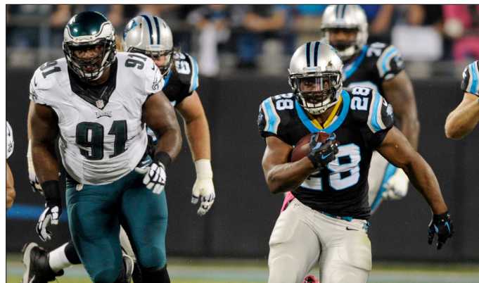
Running back Jonathan Stewart's 989 rushing yards in 2015 are the second-most of his career behind his 1,133 yards in 2009.