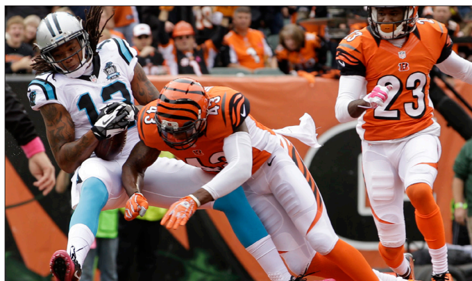
Kelvin Benjamin hauls in one of his nine touchdowns of the 2014 season at Cincinnati (10/12/14).

Benjamin's numbers are the best by a rookie in Panthers history, surpassing Keary Colbert's numbers in 2004 (47 for 754 and five).