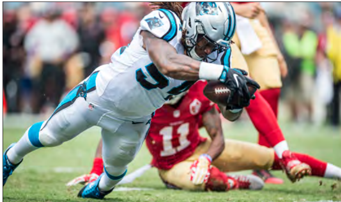
Linebacker Shaq Thompson dives into the end zone at San Francisco (9/18/16) for the first touchdown of his career.

It was the first score for Thompson since he was in college at Washington. At Washington, Thompson also saw time at running back and he last scored a touchdown in a game against the University of Colorado (11/1/14). Thompson also rushed for 174 yards that game.