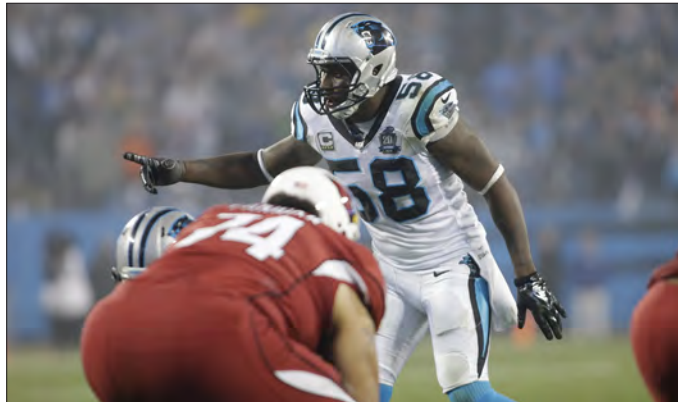
Linebacker Thomas Davis has averaged 130 tackles per season in the last four years and is the Panthers all-time leader with 966 tackles.

Davis has averaged 130 tackles per season over the last four seasons (521 from 2012-15), including a career-high 151 in 2013.