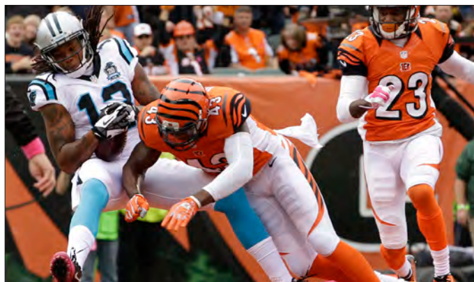
Kelvin Benjamin hauls in one of his nine touchdowns of the 2014 season at Cincinnati (10/12/14).

Benjamin produced three 100-yard receiving games in his rookie season. The three 100-yard games were the most by a rookie in Panthers history.