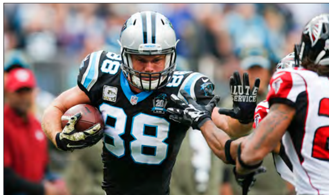
Greg Olsen is the first 1,000-yard tight end in Panthers' history, accomplishing the feat in consecutive seasons (2014 and 2015).