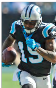
Ted Ginn, Jr.

Wide receiver Ted Ginn, Jr. has been very productive as part of Carolina's offense.