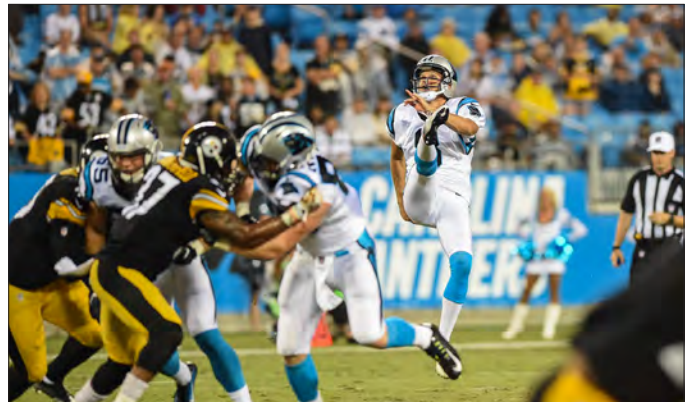
Newly-acquired punter Andy Lee is among the NFL leaders at his position.

In 2011, Lee recorded the second-best single-season net punting average in league history (44.0). He followed that performance with a 43.2 net punting average in 2012, the sixth-best single-season average in NFL history. In 2007, Lee recorded 42 punts downed inside the 20, which is tied for the third-best total in NFL history.