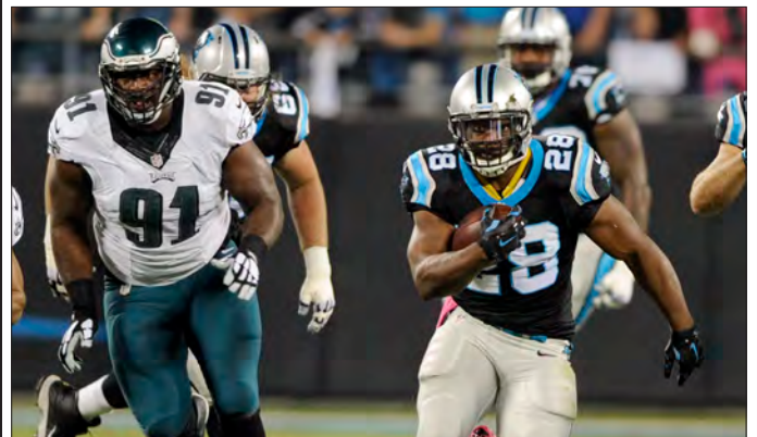
Running back Jonathan Stewart's 989 rushing yards in 2015 are the second-most of his career behind his 1,133 yards in 2009.

Stewart stands second in franchise history with 1,303 rushing attempts, 5,887 rushing yards and 13 regular season games with 100 or more rushing yards. He is third in team history with 36 career rushing touchdowns.