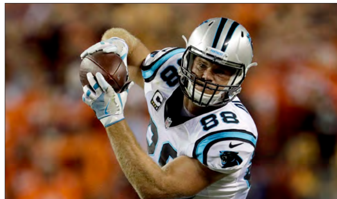
Greg Olsen has 554 receptions and 6,487 receiving yards, both in the top 10 all-time among NFL tight ends.

Olsen is tied for 12th (Ben Coates, 1991-2000) among NFL tight ends with 50 career touchdown receptions. Olsen needs three more touchdown catches to enter the top 10 all-time among tight ends.