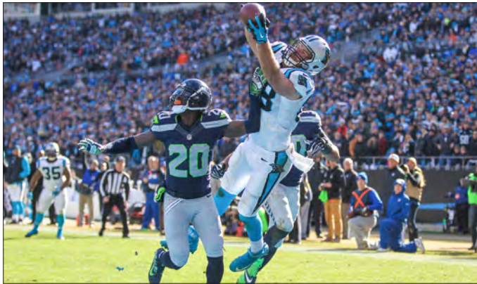
Greg Olsen ranks in the top 10 all-time among NFL tight ends in receptions and receiving yards and is approaching the top 10 in receiving touchdowns.