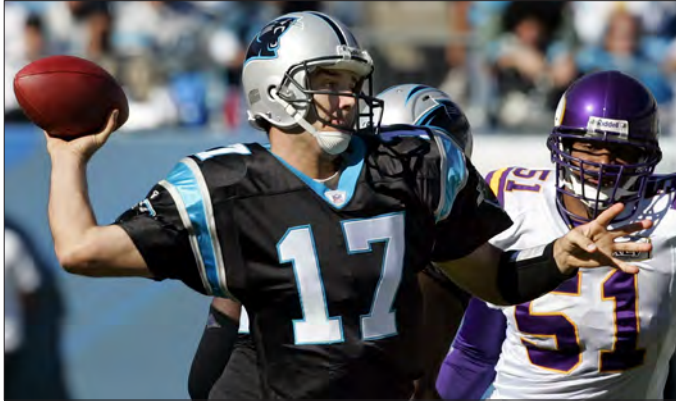
Quarterback Jake Delhomme passed for 341 yards vs. Minnesota (10/30/05)