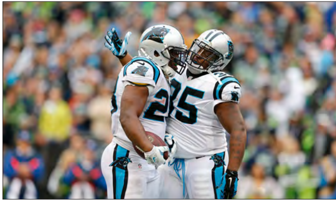
Jonathan Stewart and Mike Tolbert are two of Carolina's backs that have helped the team rush for at least 100 yards in 29 consecutive regular season games.