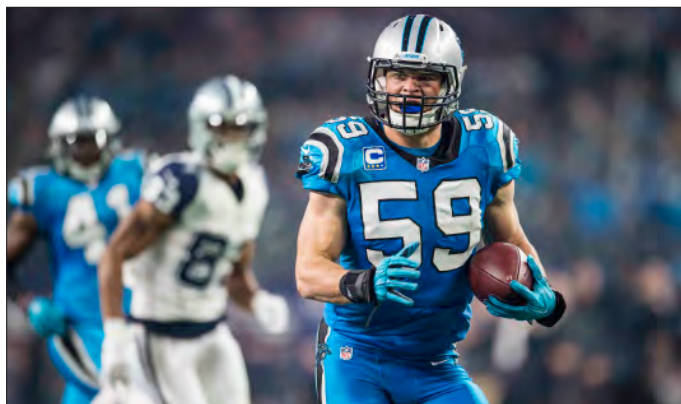
Linebacker Luke Kuechly scored his first NFL touchdown on an interception return in Week Twelve at Dallas (11/26/15).