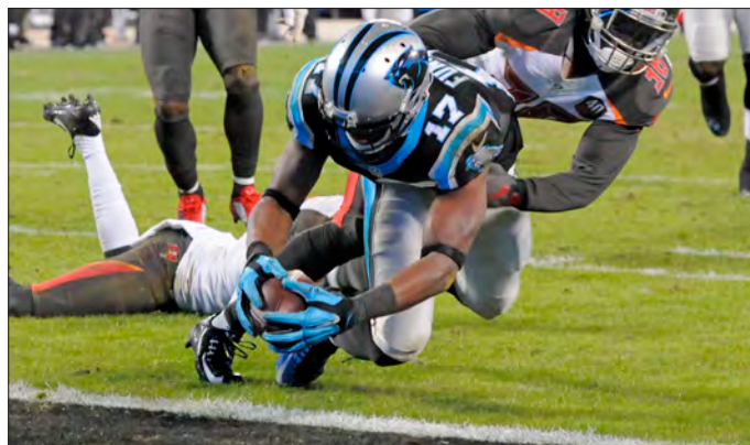
Wide receiver Devin Funchess recorded one of his five regular season touchdowns in Week Seventeen vs. Tampa Bay (1/3/16).