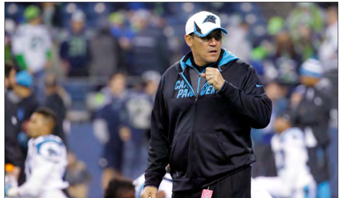
Head coach Ron Rivera has helped the Panthers to .750 regular season winning percentage since Week Six of 2013.