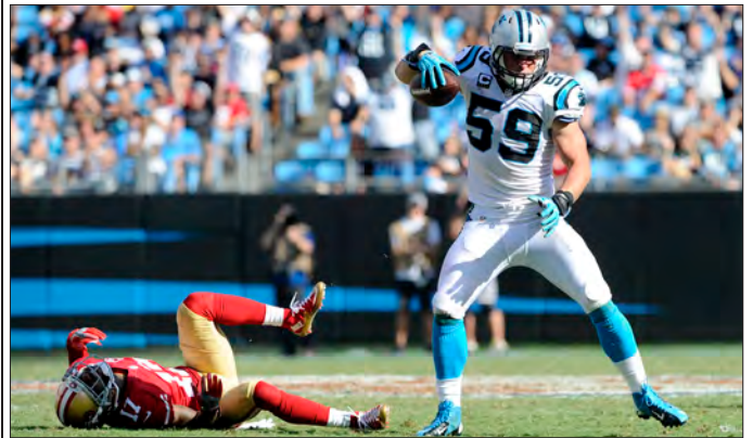
Linebacker Luke Kuechly celebrates after his interception vs. San Francisco (9/18/16).