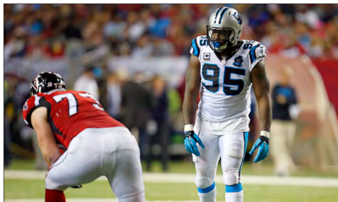
Defensive end Charles Johnson ranks second in Panthers history with 63.5 career sacks, trailing only Julius Peppers (81.0, 2002-09).