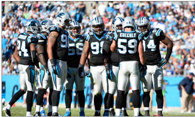
Carolina's defense finished in the top 10 for the fourth consecutive year in 2015. The Panthers are one of two teams to finish with a top 10 defense each of the last four seasons.

The Panthers also ranked among the league leaders in yards per play (second), total takeaways (first), interceptions (first), sacks (sixth) and opponent passer rating (first).