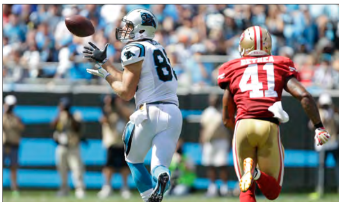
Tight end Greg Olsen was one of two 100-yard receivers for the Panthers against San Francisco (9/18/16).

Olsen and Benjamin were the first pair of 100-yard receivers since the duo accomplished the feat vs. Tampa Bay (12/14/14).