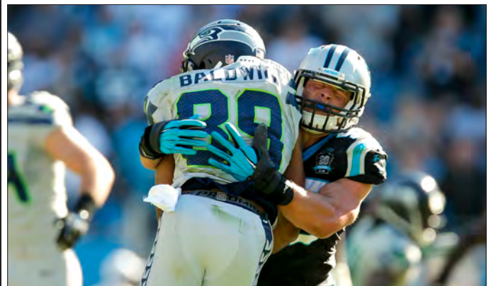
Linebacker Luke Kuechly has been among the NFL's tackle leaders since entering the NFL. No one has more than his 612 stops since the start of 2012.