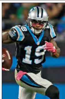
Ted Ginn, Jr.

In 2015, Ted Ginn, Jr. ranked second in the NFC and fifth in the NFL with a 10.3-yard punt return average on 27 returns with a long of 37. In each of the last six seasons, Ginn has stood fifth or higher in the NFC in punt return average.