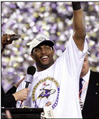
LB Ray Lewis - 2000 Super Bowl XXXV MVP

In a magnificent effort showcasing thrilling performances by their defense, offense and special teams units, the Baltimore Ravens won Super Bowl XXXV with a 34-7 victory over the New York Giants. Allowing the Giants a meager 152 total net yards, New York's attack crossed midfield just twice, while Baltimore's "D" posted 4 INTs. LB Ray Lewis was named the game's MVP, capping an accolade-filled season in which he was also tabbed the NFL's Defensive Player of the Year.