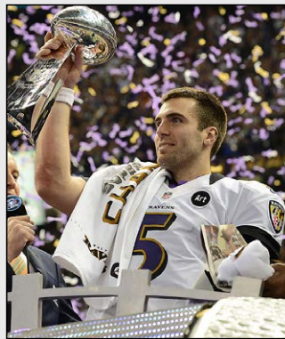
QB Joe Flacco - 2012 Super Bowl XLVII MVP

In a magnificent effort showcasing thrilling performances by their defense, offense and special teams units, the Baltimore Ravens won Super Bowl XXXV with a 34-7 victory over the New York Giants. Allowing the Giants a meager 152 total net yards, New York's attack crossed midfield just twice, while Baltimore's "D" posted 4 INTs. LB Ray Lewis was named the game's MVP, capping an accolade-filled season in which he was also tabbed the NFL's Defensive Player of the Year.