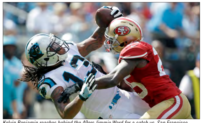
Kelvin Benjamin reaches behind the 49ers Jimmie Ward for a catch vs. San Francisco (9/18/16).

It was the third two-touchdown game (including the playoffs) of Benjamin's career. He previously scored multiple touchdowns at Philadelphia (11/10/14) and at Seattle (1/10/15).