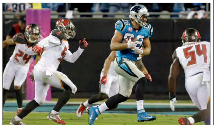
Tight end Greg Olsen totaled a career-high 181 receiving yards in Week Five vs. Tampa Bay (10/10/16).