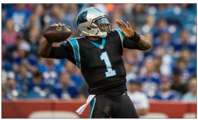
Quarterback Cam Newton ranks first or second in many of the Panthers all-time passing statistics.